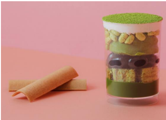
Tanba Black Bean and Matcha Parfait

Once you see Karaku's original Kyo-parfait, you'll want to take a photo. There are 3 types to choose from.