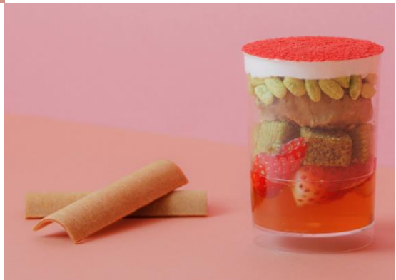
* Spring Only Strawberry and Kyoto Hojicha Parfait